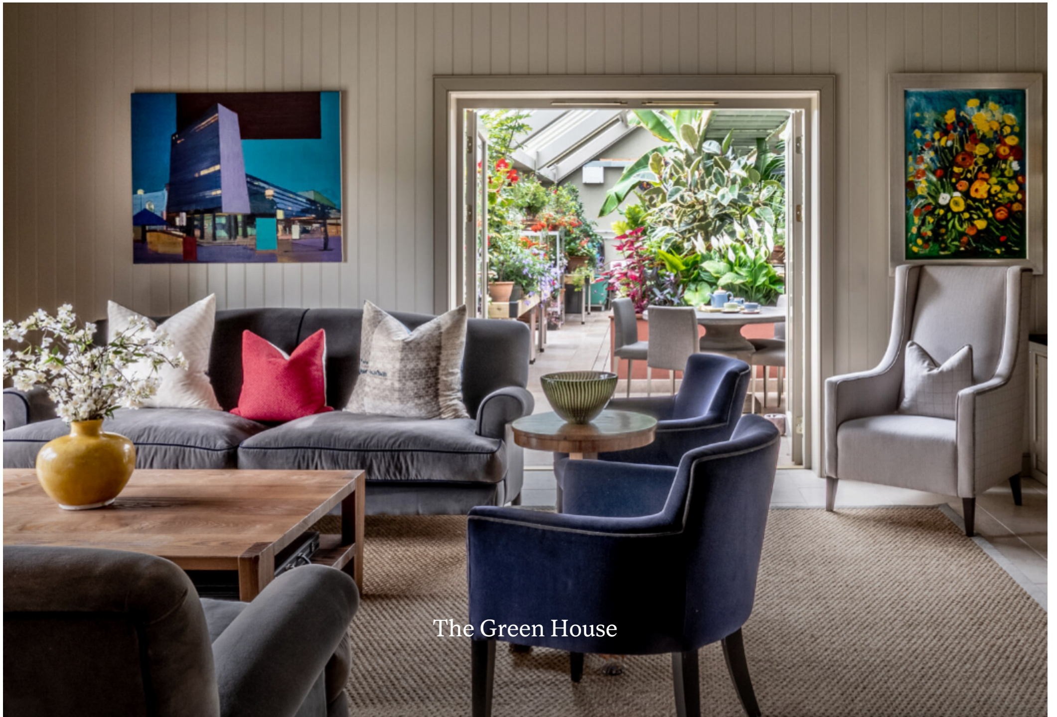
The Green House