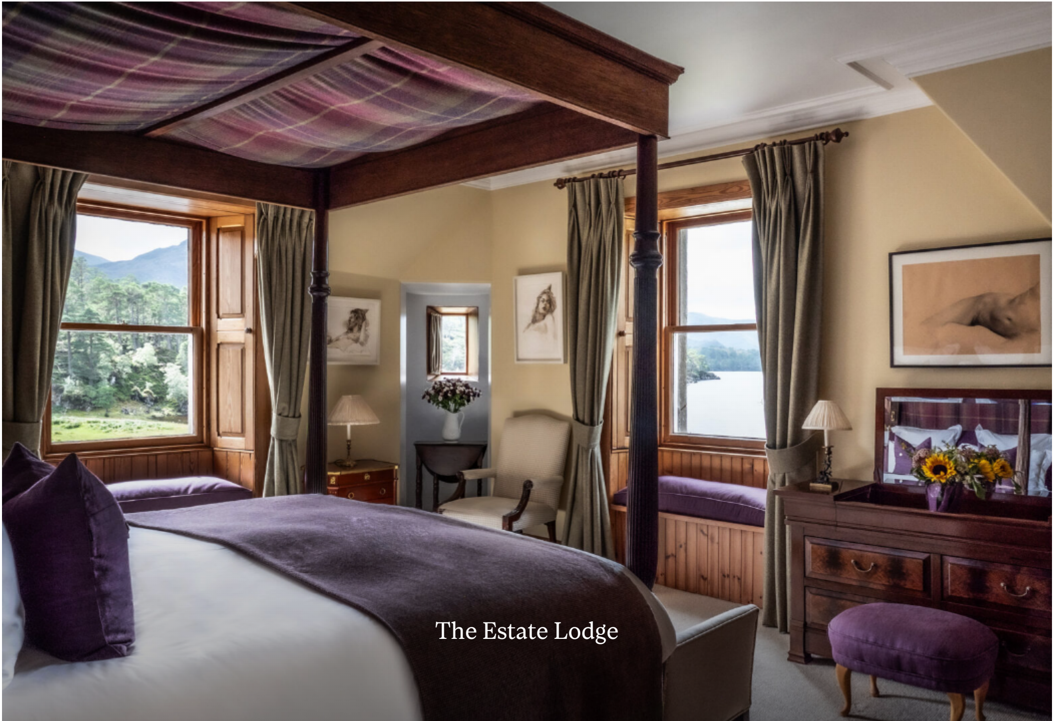
The Estate Lodge