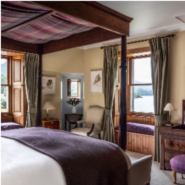
The Estate Lodge

Glen Affric offers a selection of beautifully designed bedrooms, perfect for families, friends, or couples. Each space blends comfort with traditional Scottish influences, creating a warm and inviting atmosphere. With large windows framing breathtaking views and interiors inspired by Highland heritage, The Estate Lodge, The Green House and White Cottage provide the perfect end to a day spent exploring the estate.